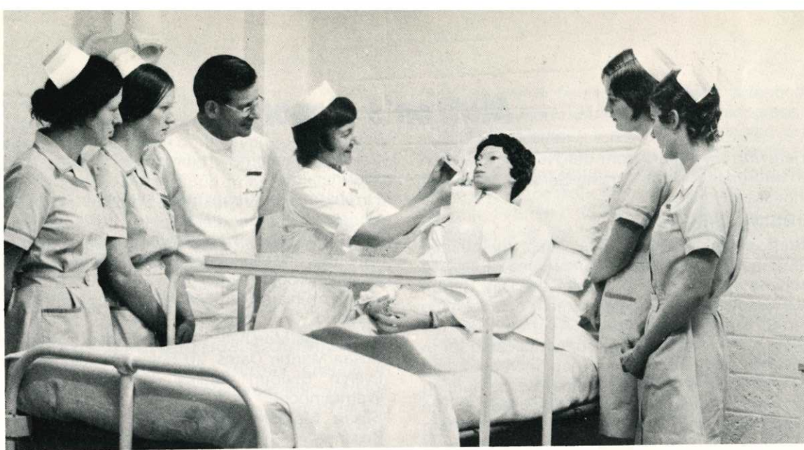
NURSING AIDE TRAINING SCHOOL DEMONSTRATION ROOM