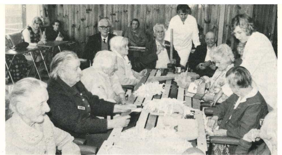
CORIO SOCIAL ACTIVITIES AND HANDCRAFTS